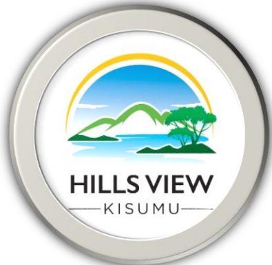
Kisumu Museum, 38 Minutes Drive, 24 KM